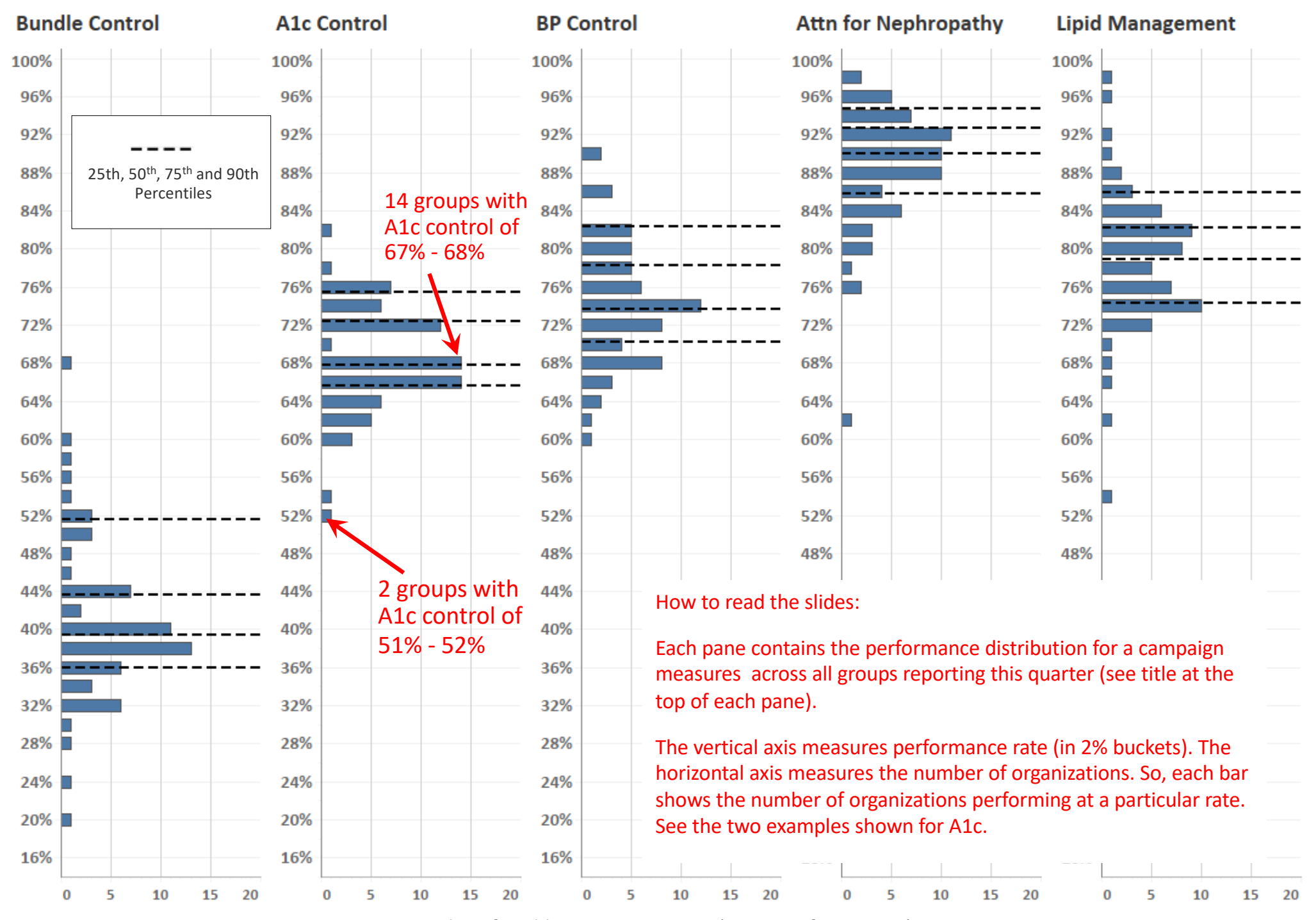
2020 Q4: Distribution of Measure Performance Rate

Number of Health Care Organizations (Reporting for 2020 Q4)