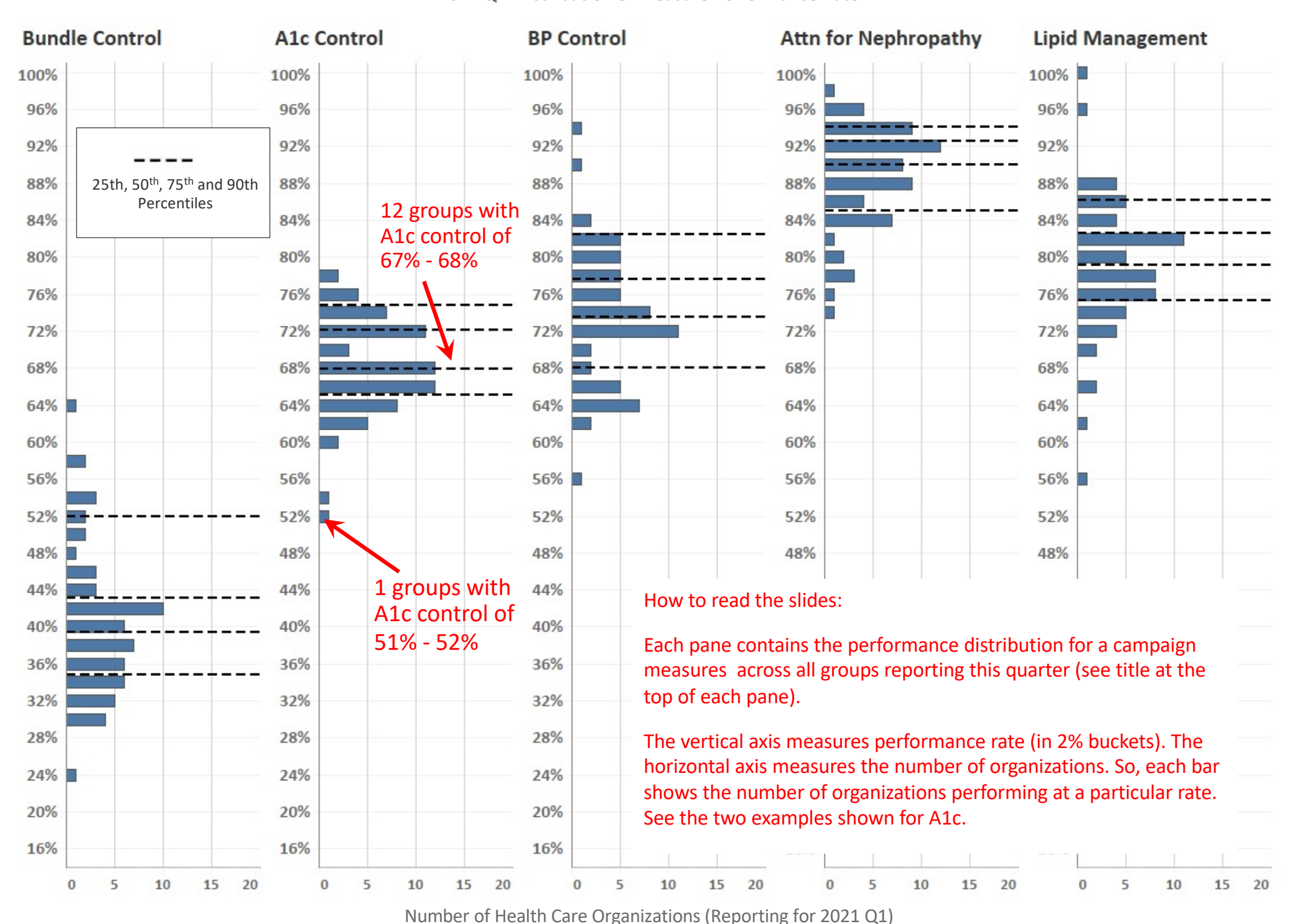
2021 Q1: Distribution of Measure Performance Rate